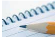
Paper and writing instrument OR print out this sheet